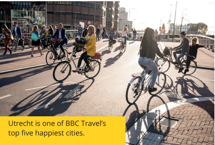
Utrecht is one of BBC Travel’s top five happiest cities.

Citywide programmes help keep Utrecht healthy and sustainable – and like the rest of the Netherlands, the city is safe, clean and has excellent infrastructure and public services. And don’t be shy about making friends with locals! The Dutch are an easy-going people, and English is widely spoken here.