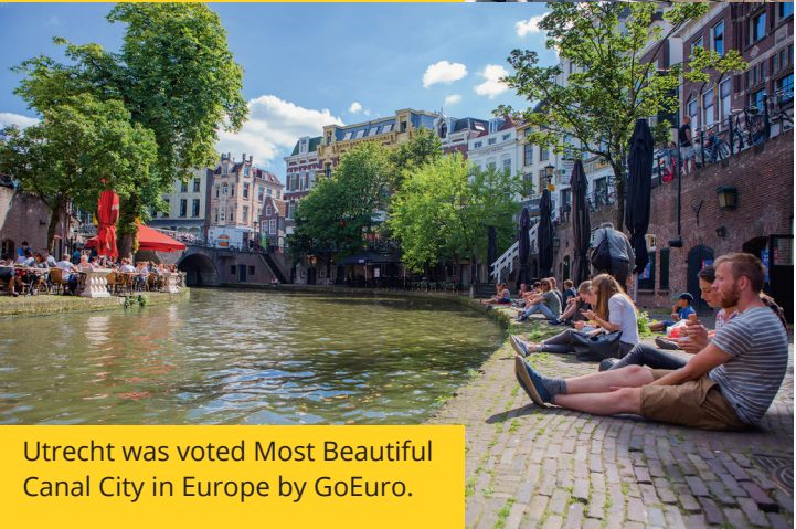
Utrecht was voted Most Beautiful Canal City in Europe by GoEuro.

‘Don’t be shy about making friends with locals! The Dutch are an easy-going people, and English is widely spoken here.’