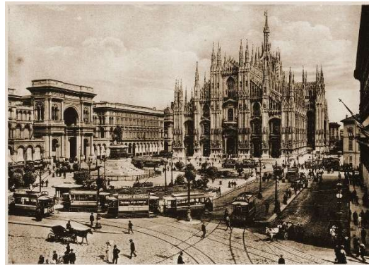
Milano Piazza Duomo - 1900