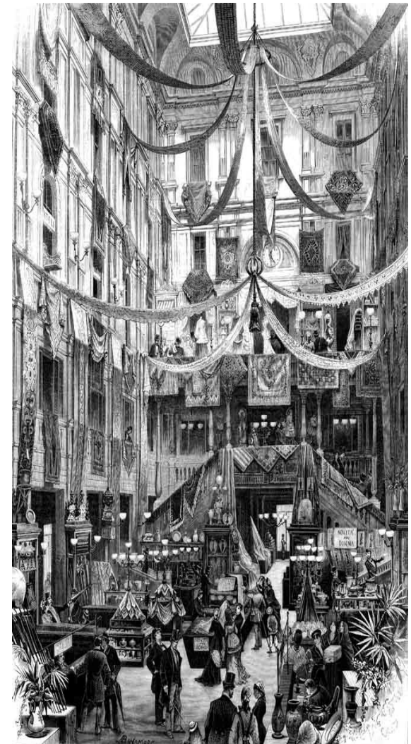
Magazzini "La Rinascente"

Università Commerciale L. Bocconi, founded in 1902 by the businessman Ferdinando Bocconi, was the first Italian University to grant a degree in Economics .