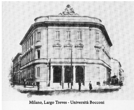
Bocconi in 1902